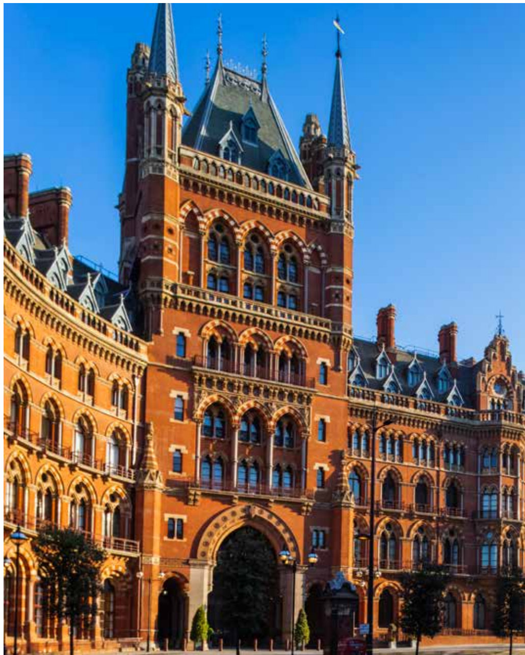
Victorian splendour: St Pancras station in London, opened in 1868.