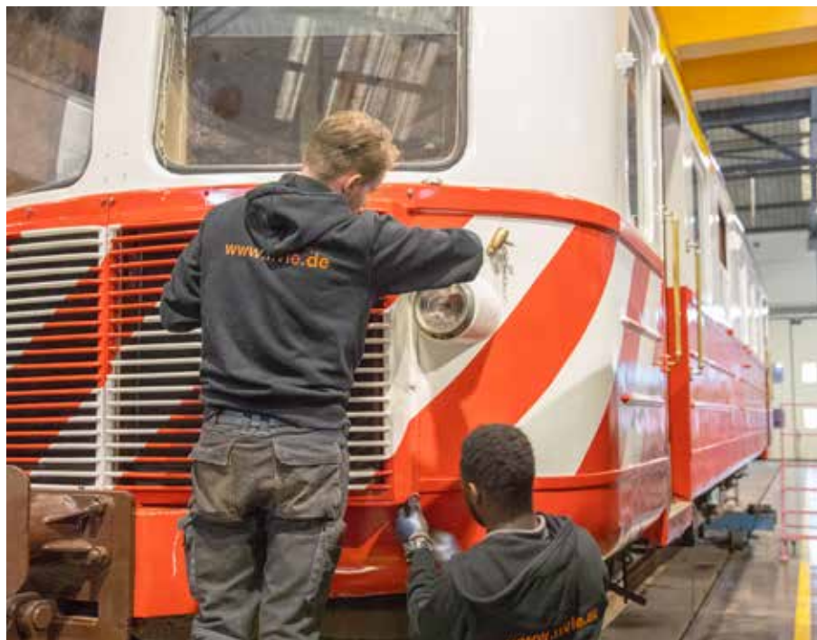
Restoring historic rail vehicles is a great pleasure – but requires a lot of commitment from the team.