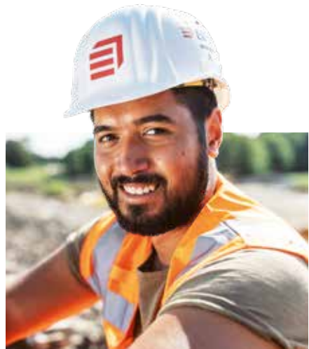
Diverse opportunities in traffic route construction for pupils, students and graduates.