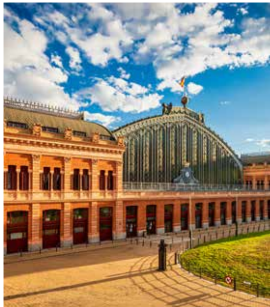
Madrid's architectural jewel: the impressive Atocha railway station.

Perhaps you will travel on to Zurich and Lausanne. Here you will visit the train station with its Art Nouveau elements and make a detour