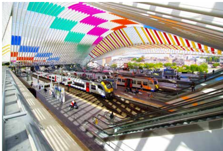
Liège-Guillemins station has one of the most spectacular roofs in Europe.