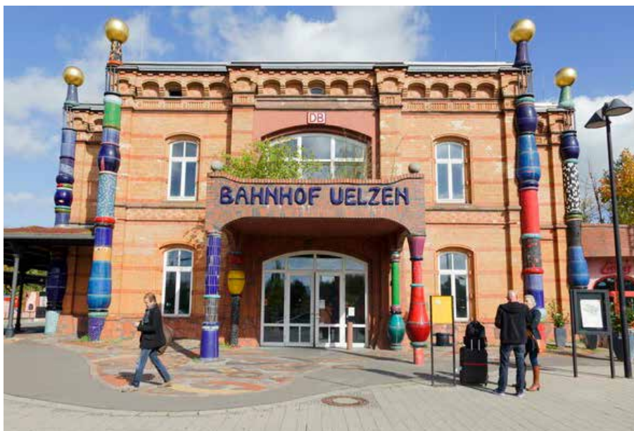
A colourful work of art: the Hundertwasser railway station in Uelzen (Lower Saxony) enchants with its shapes and vibrant colours!