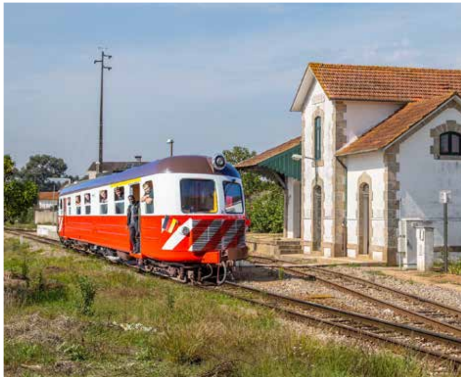
A Jewel: Together, HVLE 2022 trainees restored Nohab railcar 9103 on the Aveiro-Sernada de Vouga narrow-gauge railway in Portugal.