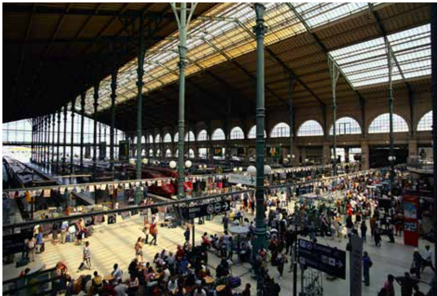
The vibrant soul of Paris: welcome to the timeless elegance of the Gare du Nord!