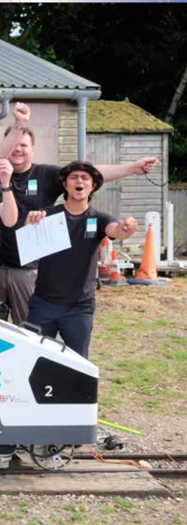
Right: Excitement is in the air when the vehicles have to prove themselves in the Energy Recovery Challenge.

Doing something for the climate – that means building a locomotive in the European Railway Challenge 2023. In the competition, teams of students, trainees and young professionals design, build and test a 10 ¼ inch gauge locomotive and compete against each other with their self-built locomotives. The vehicles are compared on such contemporary and important points as energy efficiency, noise emission or reliability. The highlight: the one-hour endurance run.